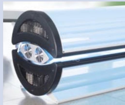
Extra-fresh extra. Duo body fan.