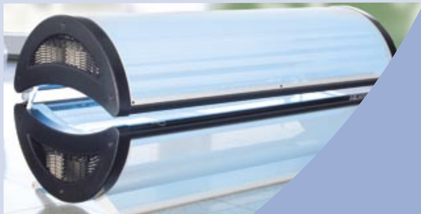
Style: the canopy is covered in a finely perforated metal sheet