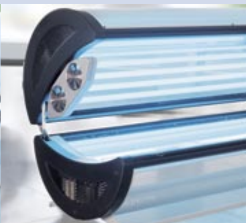
Ergonomic shape. For comfy sunbathing.